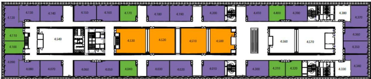
Maison du Savoir - 4 ème étage

Espace MSA 0352030 (coffee breaks, poster session)